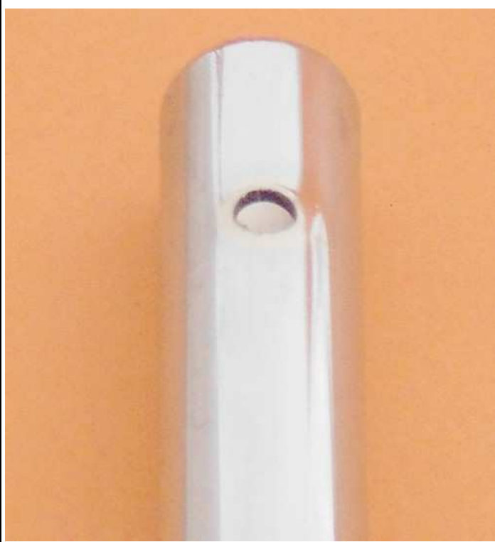
Foto from the steering column with the section with the knurling for the steering wheel hub (knurling according to DIN 82 - RAA1).