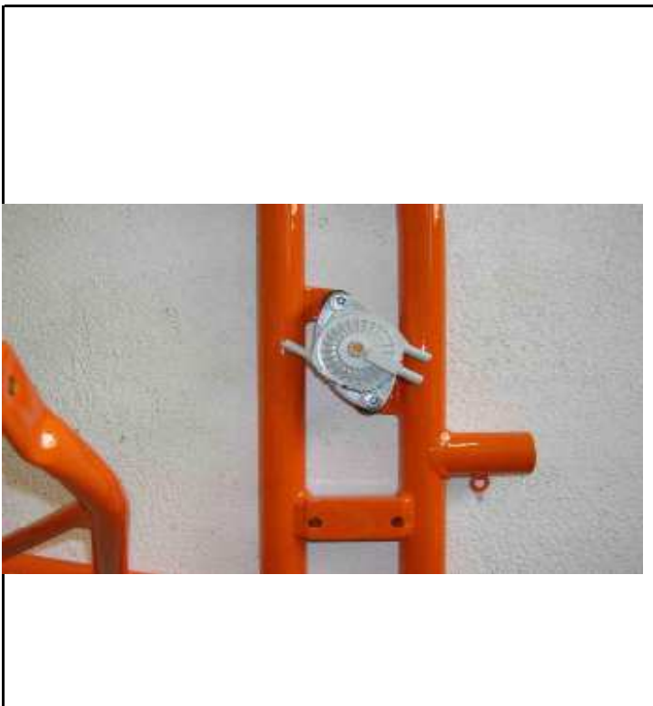
Foto of the frame with the section of the support for the fuel pump (fuel pump mounted)