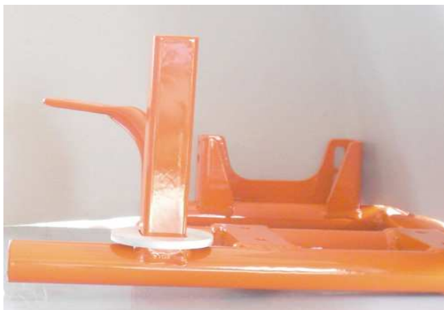
Foto of the frame from the side with the section of the support for the RTPS (Rear Tire Protection System)