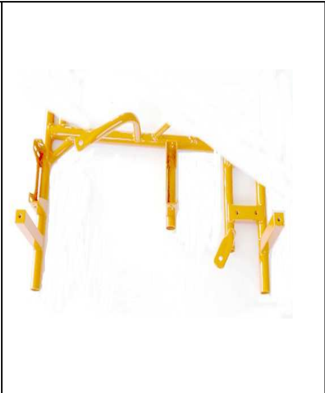
Foto from above of the frame with the section of the two supports for the exhaust system