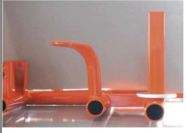
Foto of the frame from the back with the section of the support for the RTPS (Rear Tire Protection System)