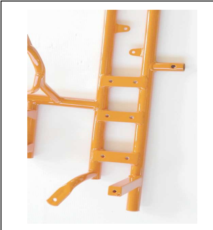
Foto from above of the frame with the section of the engine mount