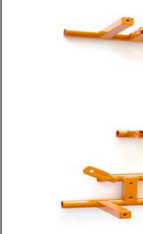
Foto from above of the frame with the section of the two supports for the RTPS (Rear Tire Protection System)